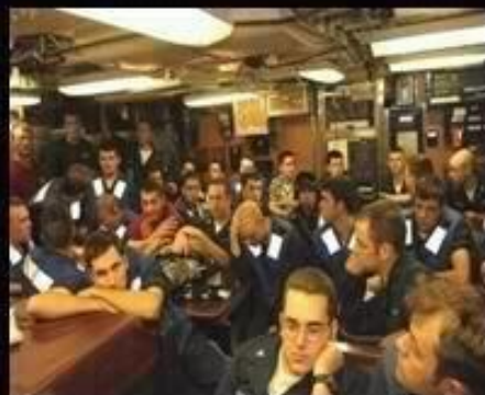
What my family thinks I do