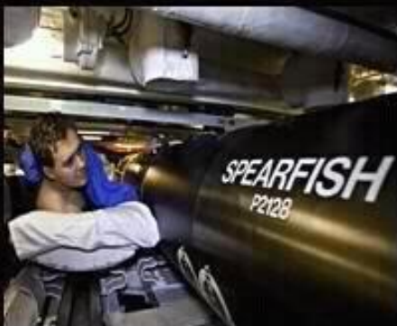
What!? I thought we just finished field day?