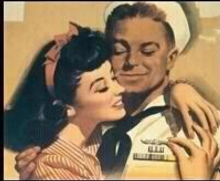
What the recruiter wants me to think that I'll do