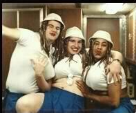
What the surface navy thinks I' do