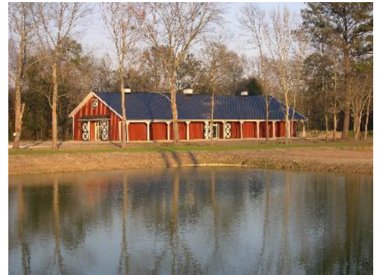
Located in Dorchester.

Place: Gatherings Dorchester, SC (maps will be provided)