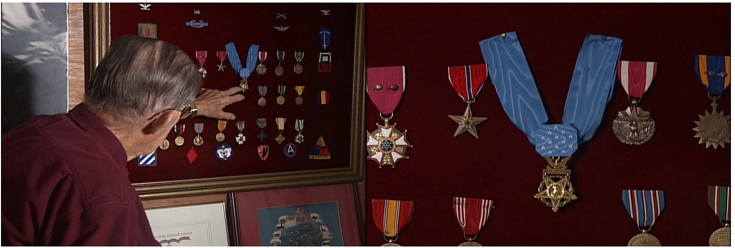
Van T. Barfoot's Medal of Honor citation:

This 1944 Medal of Honor citation, listed with the National Medal of Honor Society, is for Second Lieutenant Van T. Barfoot, 157th Infantry, 45th Infantry: