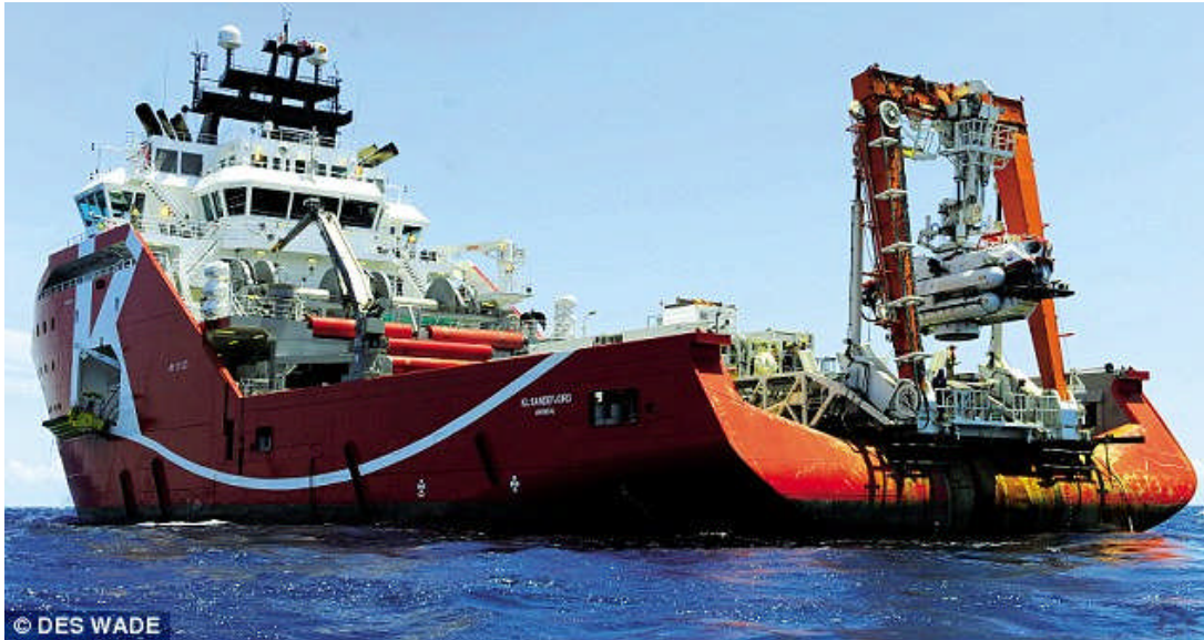
The SRV prepares to launch from the back of the Norwegian mother ship, KL Sanderford, in the Mediterranean.

When it was built during the Cold War, the Kilo-class Alrosa was designed for anti-submarine and anti-ship warfare. Its mission was to snoop, avoid detection, and try to track and, if required, attack Nato forces. Now, for the first time, a Russian submarine is actually taking part in a Nato exercise.