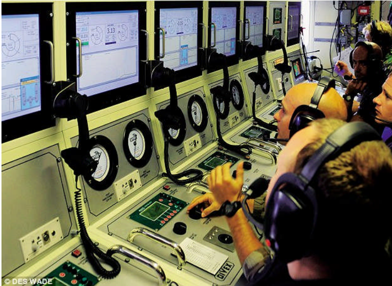
British and French divers monitor the decompression chambers from the control room above

Liverpool Bay in 1939, which stunned people at the time. The water was not that deep, only about 150ft, and her bow became wedged on the bottom while her stern was sticking up in the air. People couldn't believe that we couldn't get the men out it just seemed unbelievable but we lost 99 men there.'