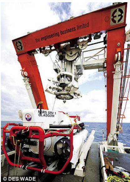
The Faslane-based submarine rescue vehicle (SRV), which weighs 30.2 tons and travels at just under four knots

This latest 'free-swimming' vehicle replaced an earlier LR5 rescue vehicle, the idea for which came to former Royal Navy submariner Roger Chapman after he almost died when he was trapped 1,575ft down in a civilian mini-submarine in 1973. He and a colleague had been laying a telephone cable in a two-man sub on the bed of the Atlantic, 150 miles off the coast of south-west Ireland. After three and a half days they were found and pulled to safety.