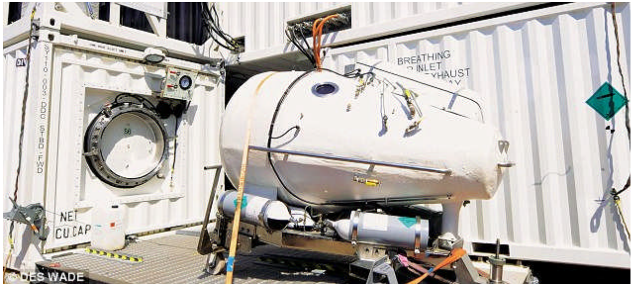
A two-man portable decompression chamber at the front of the Transfer Under Pressure (TUP) unit – it can be docked with the main chamber to transfer patients

If a submarine is damaged then those on board will more than likely be experiencing high levels of pressure deep under the sea so the other vital part of the Nato set-up is the TUP (transfer under pressure) system, which is designed to prevent rescued men suffering decompression sickness, or the bends. If Nemo acts like an ambulance then this is the hospital.