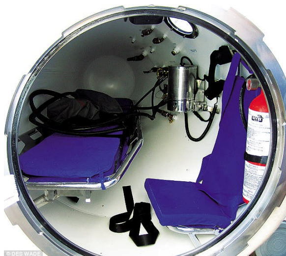
Inside the portable chamber, in which a patient and an attendant can be airlifted to hospital while under pressure

The Affray was the last British submarine to be lost with all hands, off the coast of Alderney in 1951, but there have been many accidents since.