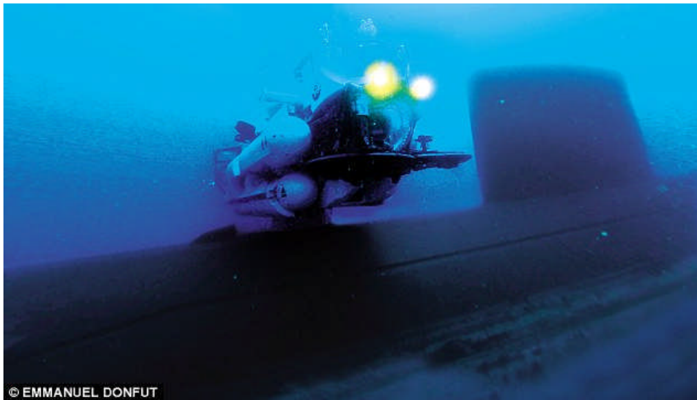
The Nato submarine rescue vehicle (SRV) mates with a bottomed sub. Nemo is the most advanced in the world and is jointly owned by Britain, France and Norway.