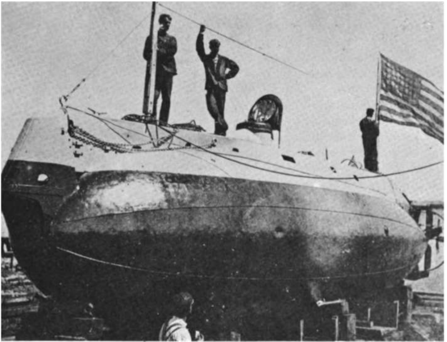
Launching U.S.S. Holland in 1900. Holland marks the beginning of America's undersea fleet, and official recognition of the submarine as a legitimate warship.

For years afterward I continued to serve in submarines afloat. Then, as naval duties took me away from the submarines, I followed their steady development with undiminished interest. When I assumed Command of the Pacific Fleet, I hoisted my flag in USS GRAYLING (SS-209). When detached, after V-J Day which owed so much to the valor, skill and dedicated service of submariners, I lowered my flag from the gallantly battle-tested USS MENHADEN (SS-377). While Chief of Naval Operations, with imaginative leaders like my Deputy, Vice Admiral Forrest Sherman, Vice Admiral Charles A. Lockwood, Naval Inspector General, who brilliantly commanded our Pacific submarine operations during much of World War II, and Vice Admiral Earle Mills, Chief of Bureau of Ships, I was happy to initiate the development of nuclear power afloat.