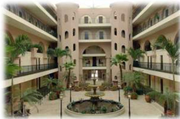
Embassy Suites Historic Charleston

Help with the continued support of our Admiral Osborn Scholarship fund by buying some tickets or even a few dozen!