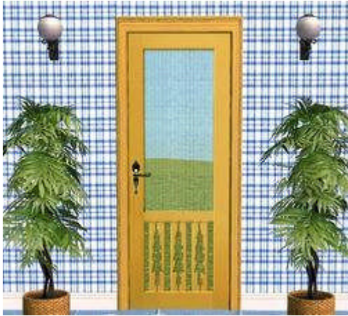
Police artist's sketch of the probable perpetrator