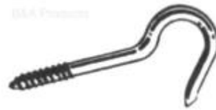
Weapon of choice